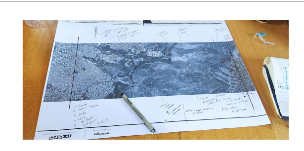
FIGURE 2 Canvas 1 filled at the Co-design Workshop of 5.6.2022

4.2), the equipment required was immediately provided and VFPTK set up the service. For the other more complex services (see section 4.2), researchers produced detailed technical reports that were later discussed in collaborative sessions with the VFPTK to finalize the desired functionality. This is an ongoing process in which both researchers and VFPTK contribute with their respective knowledge and technical capacity. Open-source software and open design hardware are used as much as possible. The results of these actions are reported below.