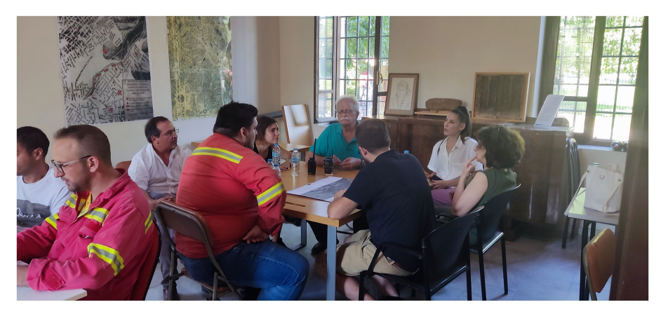
FIGURE 1 Co-design Workshop, 5.6.2022.