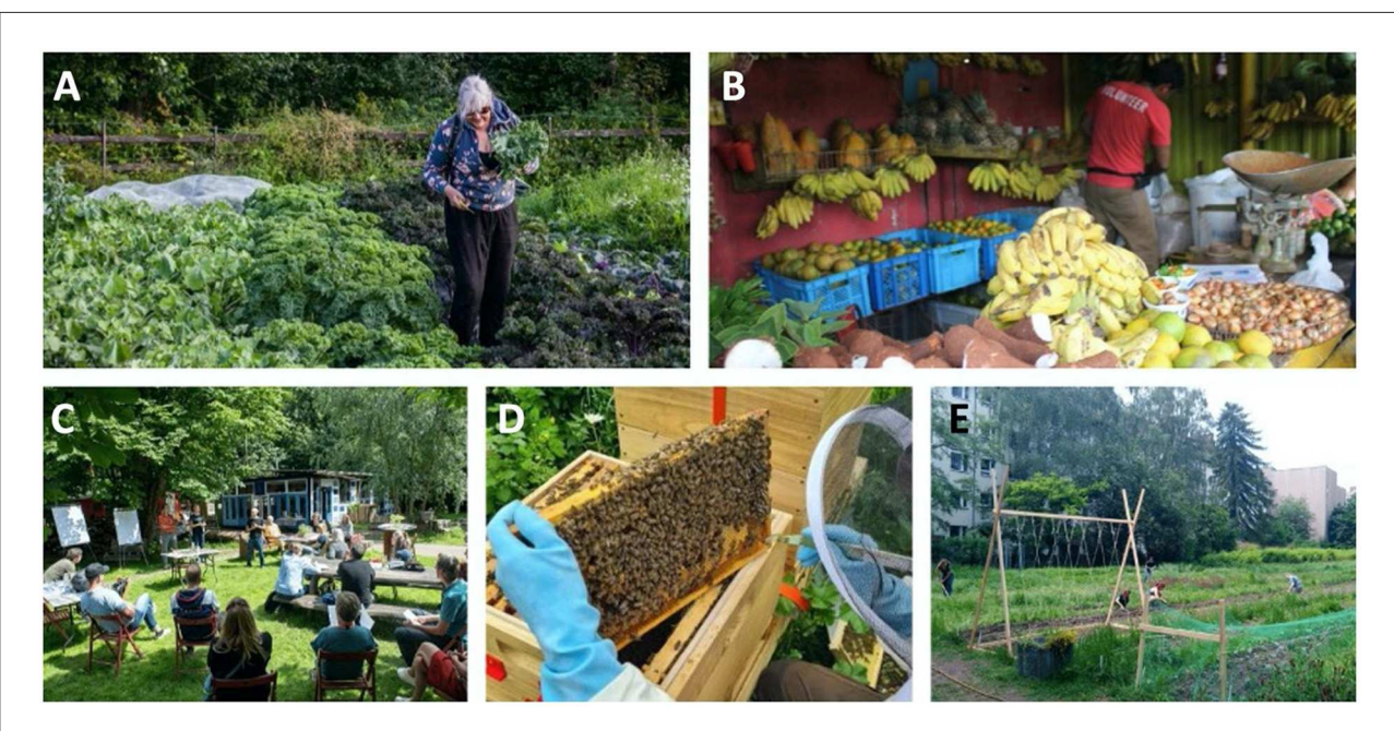
FIGURE 2 Images from the EdiCitNet Living Labs in Oslo (A), Havana (B), Rotterdam (C), Andernach (D), and Berlin (E).