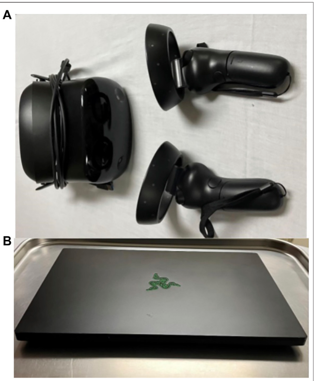
FIGURE 1 | VR Simulator Setup: (A) Microsoft Mixed Reality headset and joysticks and (B) Razor Blade 15 laptop with Intel Core i7-8750H CPU @2.2GHz, 6 Core, NVIDIA GeForce RTX 2070 Max-Q (B).

The structured pre and post-survey data and analysis evaluating characteristics and responses of participants who indicated supporting further similar training (likert greater and less than 8/10) are presented in Table 3. The participants had a wide range of years (yrs) of experience, 2-33 years, with an average of 8.3 years. Individuals who supported further use of VR had an average (AV) of 6.3 years experience (SD 4.0, 95% CI 3.9, 8.7) versus those that did not support further use who maintained an average of 14.8 years experience (SD 12.2, 95% CI -4.0, 34) (p-value 0.0306). Overall, participants indicated relatively little experience with VR (AV 3.4/10, SD 3.0, 95% CI 1.8, 4.9). Participants showed moderate experience using (and appreciation) of traditional mannequin-based medical simulation with average likert responses of 6.8 and 7.5, respectively. There were various prior experiences using computer-based medical training/teaching programs (AV 5.0, SD 2.1, CI 3.9, 6.1), those who support further use of VR (AV 5.7, SD 1.0, 95% CI 0.91, 4.1) versus individuals who did not support further use (AV 2.5, SD 1.7, 95% CI 4.7, 6.9) (p-value 0.0049). Interestingly, individuals who supported further use indicated they had found prior computer training more helpful (AV 6.8, SD 1.2, 95% CI 4.7, 6.8) versus those who did not support further use (AV 4.0, SD 2.0, 95% CI 0.91, 4.1) (p-value 0.0077).