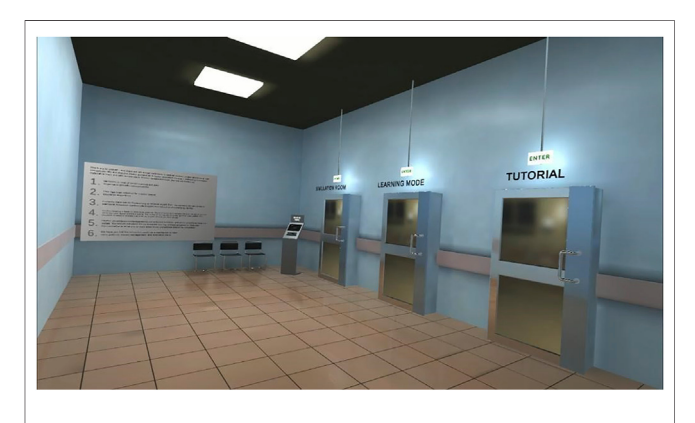
FIGURE 2 | The initial room the user enters, these doors act as a menu to enter a tutorial, learning mode, or unguided interactive simulation.

Participants indicated realistic changes in hemodynamics and response to clinical interventions (AV 7.4, SD 2.1, 95% CI 6.3, 8.5), in those who supported further use (AV 8.15, SD 1.46, 95% CI 7.3, 9.0) versus those who did not support further use (AV 4.33, SD 1.15, 95% CI 1.5, 7.2) (p-value 0.0080). Overall, participants indicated the training environment felt realistic (AV 8.3, SD 1.4, 95% CI 7.6, 8.0) in those who supported further use (AV 8.8, SD 0.90, 95% CI 8.3, 9.3)