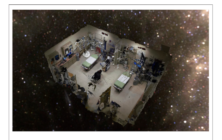
FIGURE 3 | The virtual environment was created using a photogrammetry 3D scan of the Madigan Army Medical Center trauma bay, a representative image from that scan is shown in this panel.