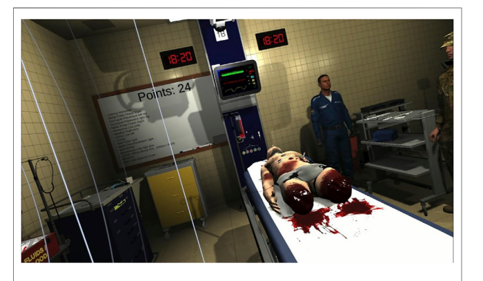
FIGURE 4 | A screenshot of the learners view in the massive external hemorrhage simulation. The items on the wall and table are used to interact with the patient to complete assessments, obtain vitals, and treat injuries.