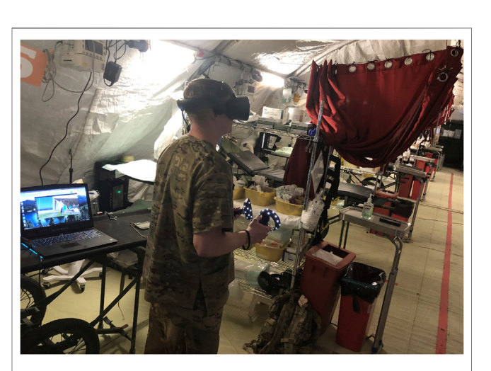
FIGURE 6 The simulator works without an instructor and does not need an internet connection. The authors took a headset and laptop on a deployment to Iraq. In this panel, a combat medic can be seen using a beta version of the VR simulator in 2019.