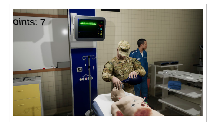
FIGURE 5 | A screenshot of a medic using a bag-valve-mask on a patient with internal hemorrhage. This is one of two non-player characters that are present. The learner gives commands to these characters through point and click menus and via a hand tablet interface.

versus those who did not support further use (AV 6.5, SD 1.4 95% CI 7.6, 8.0) (p-value 0.0023). Some participants found the headset challenging to use (AV 2.9, SD 1.4, 95% CI 1.9, 3.3), in those who supported further use (AV 2.3, SD 1.4, 95% CI 1.4, 3.2) versus those who did not support further use (AV 3.5, SD 0.58, 95% CI 2.6, 4.4) (p-value 0.0487). Individuals who did not support further use of VR indicated that a PC/Phone based version would be better than virtual reality, while those who supported further use of the VR training modality indicated VR would be much better (p-value 0.0099) (our small sample size makes this calculation statistically fragile). Several participants experienced side effects (41%), the majority indicated mild nausea (35%), mild headache (6%), and mild dizziness (6%). Three participants (18%) stopped early due to side effects. One participant stopped 10 min into the scenario, and two participants after 20 min. The individual who stopped after 10 min did not support further use; however, the two individuals who stopped after 20 min supported further use of the training modality. Further information on side effects and associated demographics are represented in Table 4.