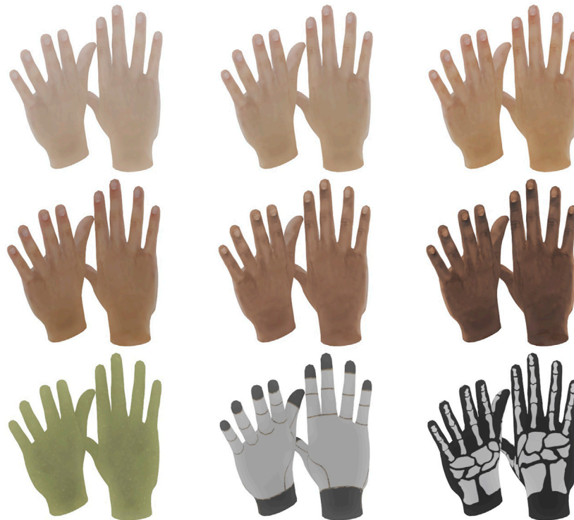
FIGURE 1 | We provide nine different hand textures: six skin-tone variants, an alien, a robot, and a skeleton hand. The skin-tone variants are designed to look realistic, while the non-human hands are more stylized.

the UV coordinates of those models. Additionally, we provide hand textures compatible with the 3D hand models developed for the Oculus controllers; that way researchers can utilize our hand resource for studies using both free hand interaction and controller-based interaction.