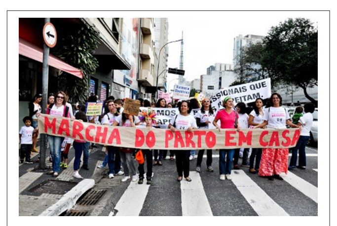
FIGURE 1 In 31 cities around Brazil, and 1 in Italy, thousands of people marched for the humanization of birth, for women's rights in childbirth, and in support of homebirth.