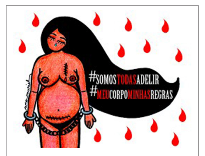
FIGURE 2 | This drawing circulated across Brazil as thousands protested her forced cesarean. Drawing by Ana Muriel.

Ric's description of his teamwork practice, see Jones, 2009; Figure 4 ).