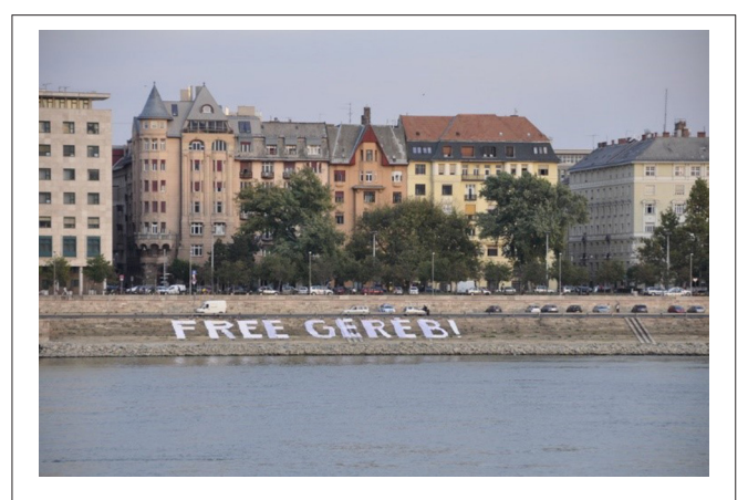
FIGURE 3 | Protest sign "Free Geréb!" on the banks of the Danube, close to the Parliament on December 10, 2010, with permission of photographer István Csintalan.