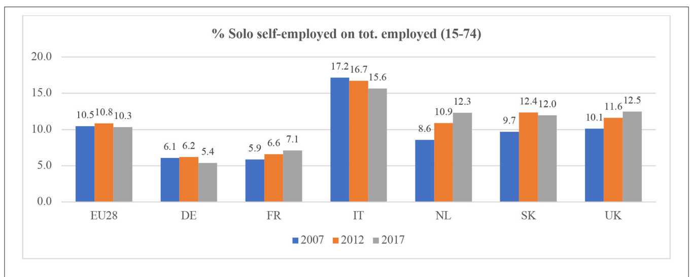
FIGURE 1 | The development of self-employment in the EU and a number of selected European countries, 2007–2012–2017 (self-employment as a % of total employment).