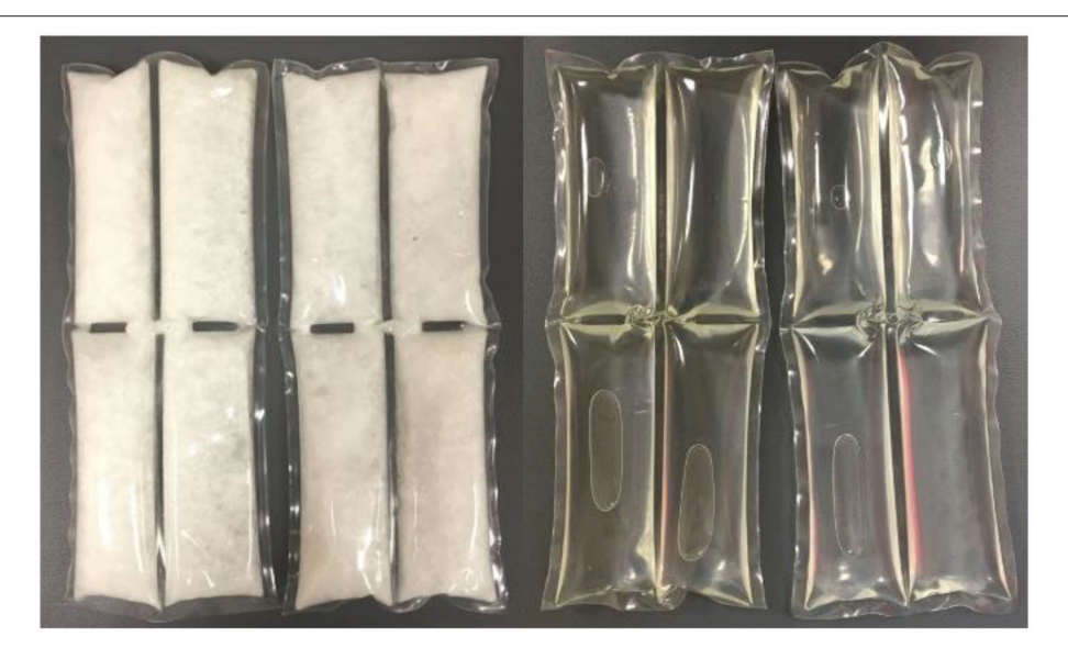
FIGURE 2 | Two Glacier Tek 15°C PCM packs in the frozen state (left), and in their melted state (right).