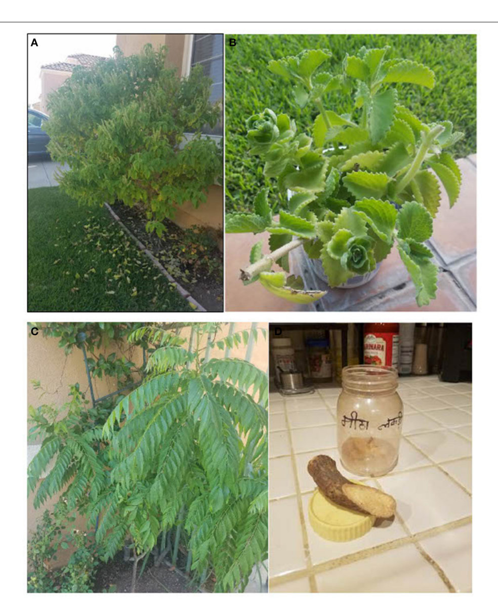
FIGURE 3 | Home sources of selected herbs by southern California Indian immigrant women. (A) Tulsi in homegarden; (B) Karpuravalli in homegarden; (C) Curry leaf tree in homegarden; (D) Meeta lagdhi (licorice root) brought from India.

because rice and curry is an inconvenient food to heat and consume in the office. The sheer complexity that embodies Indian cuisine makes it a difficult food, not only to prepare, but to transport to work or school. For these reasons, Indian food in many instances is substituted with another alternative that was easier to eat and consume in public places; they are Americans when eating out, and Indians when eating at home.