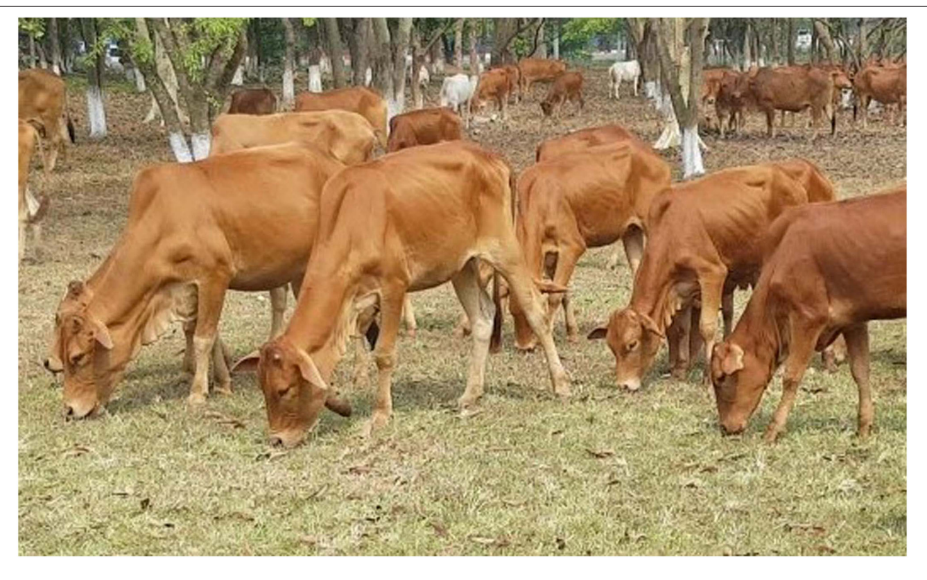
FIGURE 2 | Red Chittagong cattle of Bangladesh.

SD, standard deviation; N, number of articles that reported the parameters. From Afroz et al. (2011), Afroz et al. (2012), Alam et al. (2007), Ferdous et al. (2019), Rabeya et al. (2009), and Rahman et al. (2016).