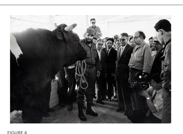
Figure 4 Fidel Castro with imported Holstein bull, Rosafe Signet, 1967. The Cuban-Canadian connection in dairy production exemplified how nation-states across the ideological spectrum converged on shaping animal bodies for food security.

During this period, governments increasingly turned to biotechnologies for mediating livestock selection (Wilmot, 2007). AI, a reproductive technology that circumvented sexual intercourse by introducing sperm to a cervix manually, was implemented as a "public service" in the dairy industry to ease breeders' pushback for disrupting their occupational identity (Derry, 2015). The UK government alleviated domestic concerns by instituting national AI centers that would combat wartime food rationing by rationalizing milk production. In 1951, 20% of cows in England and Wales were impregnated by AI; by 1958, that figure rose to 58% (Wilmot, 2007). In the Netherlands, breeders vowed not to use Holstein semen for nationalistic and cultural reasons: they wanted to protect their renowned