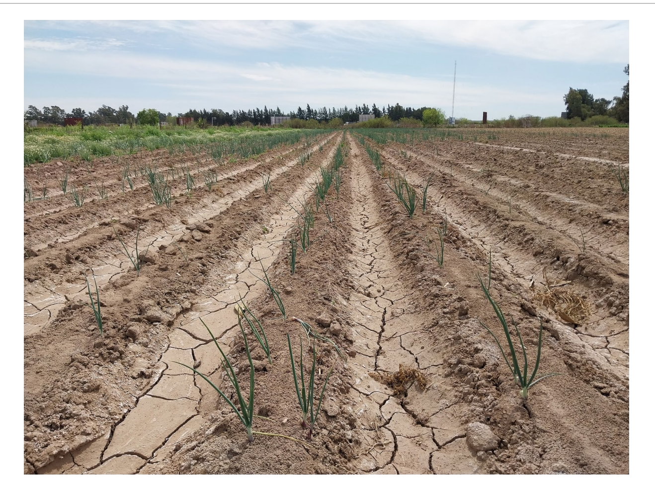
FIGURE 2 Degraded soil in the Rosario Greenbelt.

In order to evaluate the suitability of the resulting compost as a valid input for the production of organic food, several analyses were