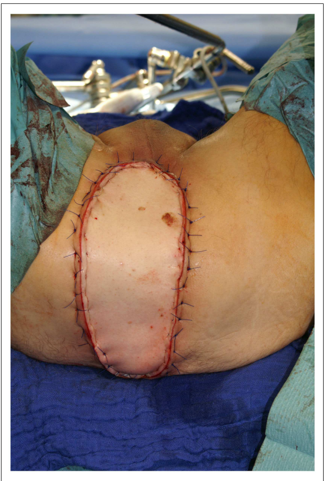
FIGURE 9 | Situation after transabdominal transposition of the flap.

Free flaps are based on a dedicated blood supply by well-defined vessels. Using these vessels, the flap can be dissected free from the surrounding tissue and transplanted to a remote defect, where the flap's vessels can be anastomosed to a local recipient vessel by means of a surgical microscope. Such flaps can incorporate various tissues from skin and subcutaneous tissue to muscle and tendons and can be harvested in various sizes. Since the choice of the right flap is not limited to the region of the defect, a variety of flaps is available for microvascular reconstruction. Therefore, the optimal flap for a certain defect can be chosen with great liberty, taking