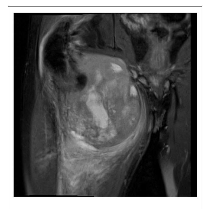
FIGURE 1 | MRI of a soft-tissue sarcoma of the thigh, reaching up to the pelvic bones.

the amputated extremity to reduce the strain after such operations at least to some extent (9). Figures 3 and 4 show the case of a patient with advanced carcinoma of the upper arm with pain and loss of function. In order to achieve a curative resection, an ISTA had to be performed and the direct closure as well as clean margins has been achieved.