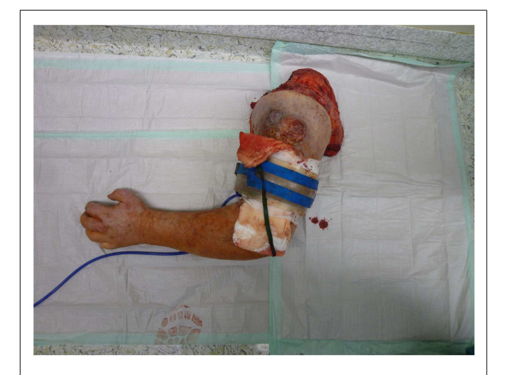
FIGURE 4 | The resected arm including the shoulder girdle at interscapulothoracic level