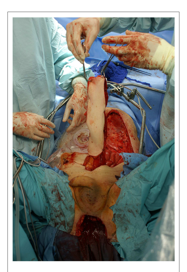
FIGURE 8 | Intraoperative aspect of the pedicled VRAM flap prepared to cover a perineal defect.

rotated up to 180° to close adjacent defects, which explains the term "propeller flap." Such flaps are seeing an increased clinical application, especially in regions where "conventional" pedicled flaps are sparely available (19). Due to their comparable skin texture and appearance as well as less bulk, such flaps can provide better esthetic results. Achieving such good esthetic results and the best quality of life possible is a high objective. However, as with the free flaps discussed later, this may not lead to neglecting the safety of the technique and therefore the patients' safety.