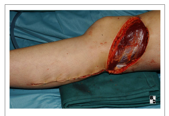
FIGURE 12 | After transposing the flap into the defect and primary closure of the donor site. The flap still requires a split skin graft.