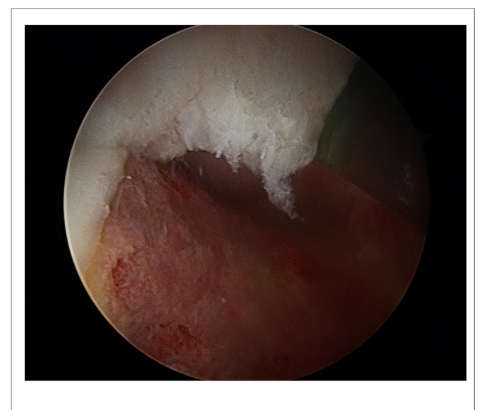
FIGURE 5 | Arthroscopic view of the hip following cam resection.