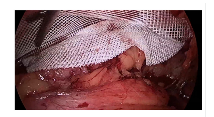
FIGURE 3 | Laparoscopic view of the inguinal abdominal wall musculature following mesh placement.

Adductor release is a newer option in the treatment of CMI/ AP. Given the opposing force of the adductor on the pelvis, this technique involves cutting the insertion of the adductor longus muscles from its insertion on the pubic bone (9). The tendon is released from its insertion approximately 1 cm from the pubis.