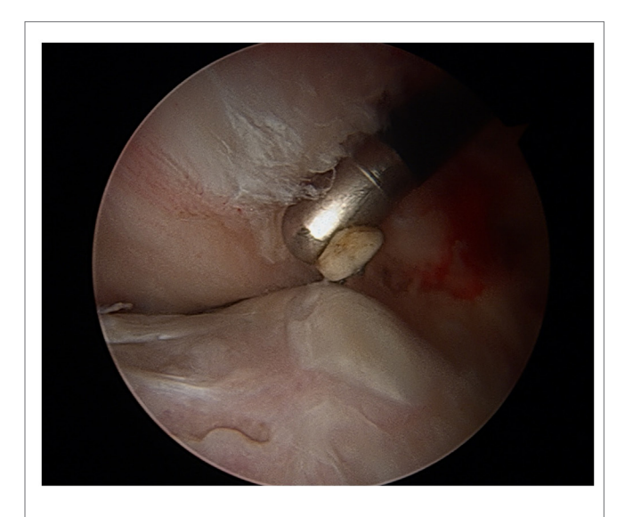
FIGURE 4 | Arthroscopic view of a cam lesion, right hip.

In patients with FAI, treatment of the impingement lesion may restore the femoral head-neck junction offset to a more physiologic state, and relieve stress on nearby muscle groups (4). Surgical techniques include open femoroacetabular osteoplasty, hip arthroscopy, or combined arthroscopy with limited open osteoplasty. FAI is confirmed visually, labral and chondral injuries are identified, debrided, or repaired. Normal bony anatomy is restored through resection of the cam lesion or with acetabular rim trimming ( Figures 4 and 5 ). A burr is used to resect the pincer deformity, and if extra-articular impingement is present, the distal portion of the AIIS is resected. The cam