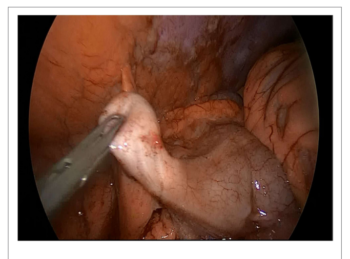
FIGURE 1 | Appendicular pseudomyxoma with enlarged base.

The general classification into four grades has been previously described ( Figure 3 ).