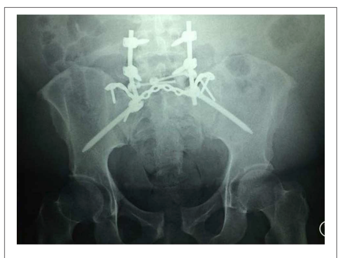
FIGURE 4 | Spinopelvic fixation construct of the third patient. A similar construct was implanted in all 3 patients.

(excellent outcome). While the patient with BMI 50 scored 52 (fair outcome).