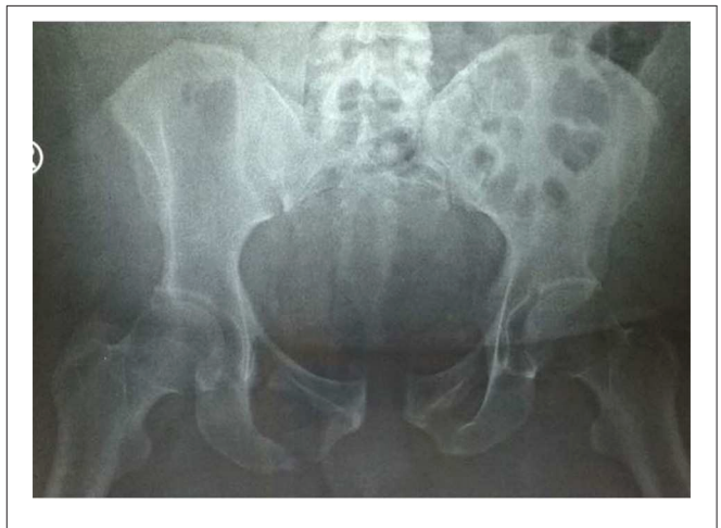
FIGURE 3 | Pelvis AP radiograph of the patient with a BMI of 50 showing unclear findings of sacral bone pathology.

a 7.0 mm long polyaxial iliac screws bilaterally. The length of the iliac screw ranges between 90–110 mm.