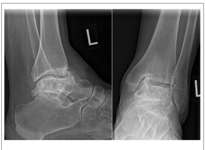
FIGURE 3 | Pre-operative left ankle radiographs. Note the severe collapse since the previous radiograph and groove in the medial corner of the tibial plafond.

cobalt chrome (see Discussion). This was performed using the same image processing file as for the right side but inverted for a left talus.