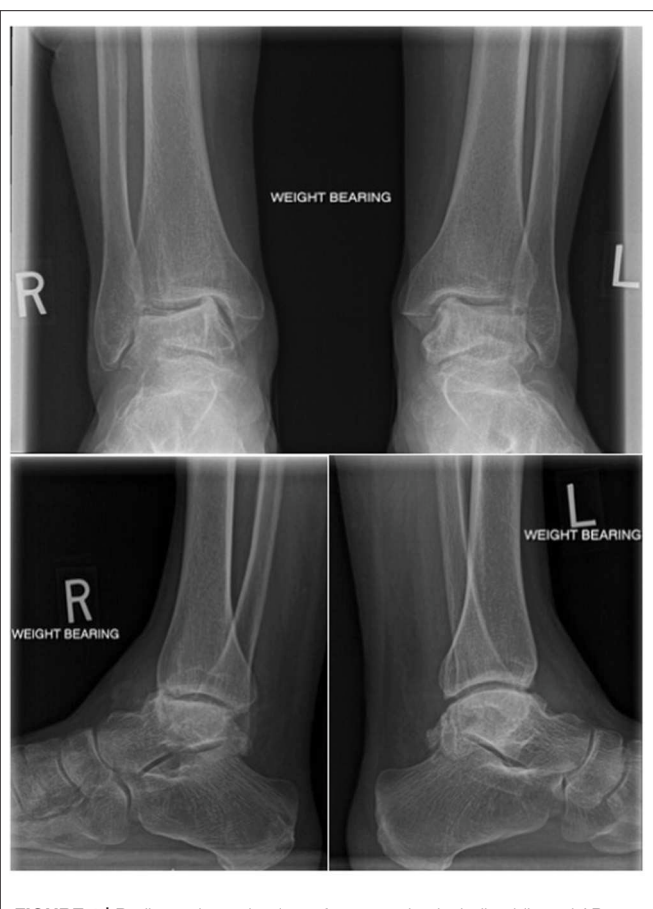
FIGURE 1 | Radiographs at the time of presentation including bilateral AP weightbearing, right ankle weightbearing lateral and left ankle weightbearing lateral views.

pre-existing fusion on one side and talar AVN with collapse on the other side.