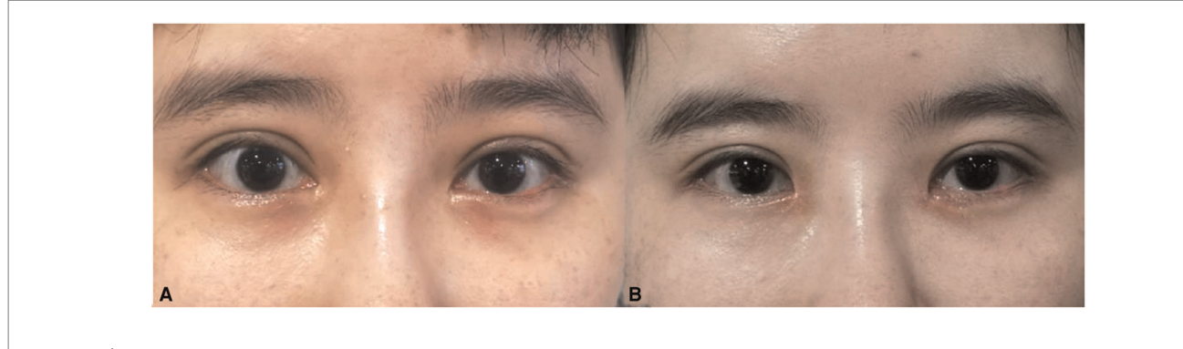
FIGURE 6 | Case 2 (A) Before surgery and (B) Six months after surgery.

depressed deformity was observed in the angular region. The author used a bird-beak-type z-shaped asymmetrical flap to repair and reconstruct the inner canthus fold and the depressed deformity in the angular region. The postoperative results were satisfactory (see Figure 6 ).