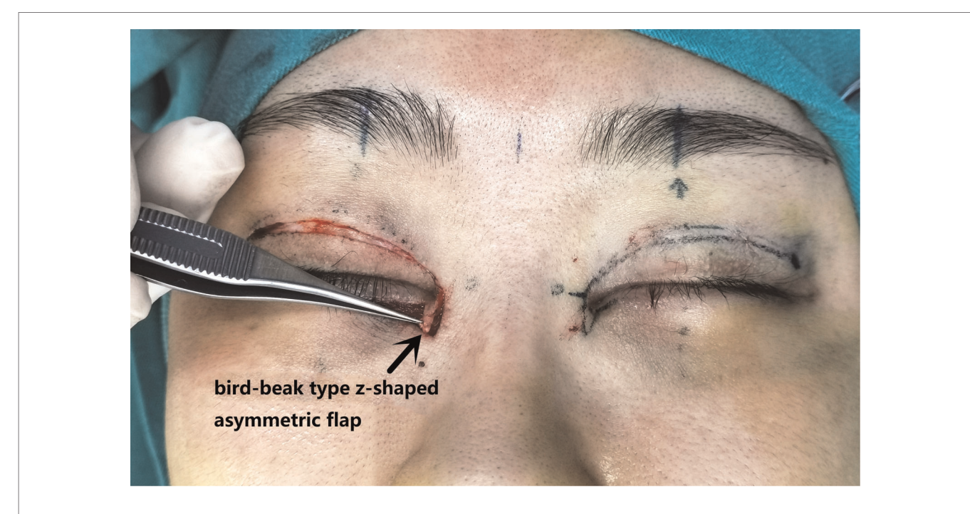
FIGURE 2 | Diagram of the z-shaped asymmetric flap design.

inner canthus (see Figures 2 and 3 ). Absorbable thread (8-0) was used to suture the incision between the upper and lower eyelid margin (two stitches). The z-shaped asymmetrical flap was then set as the covering surface of the reconstructed medial canthal fold, with the medial canthal tendon complex