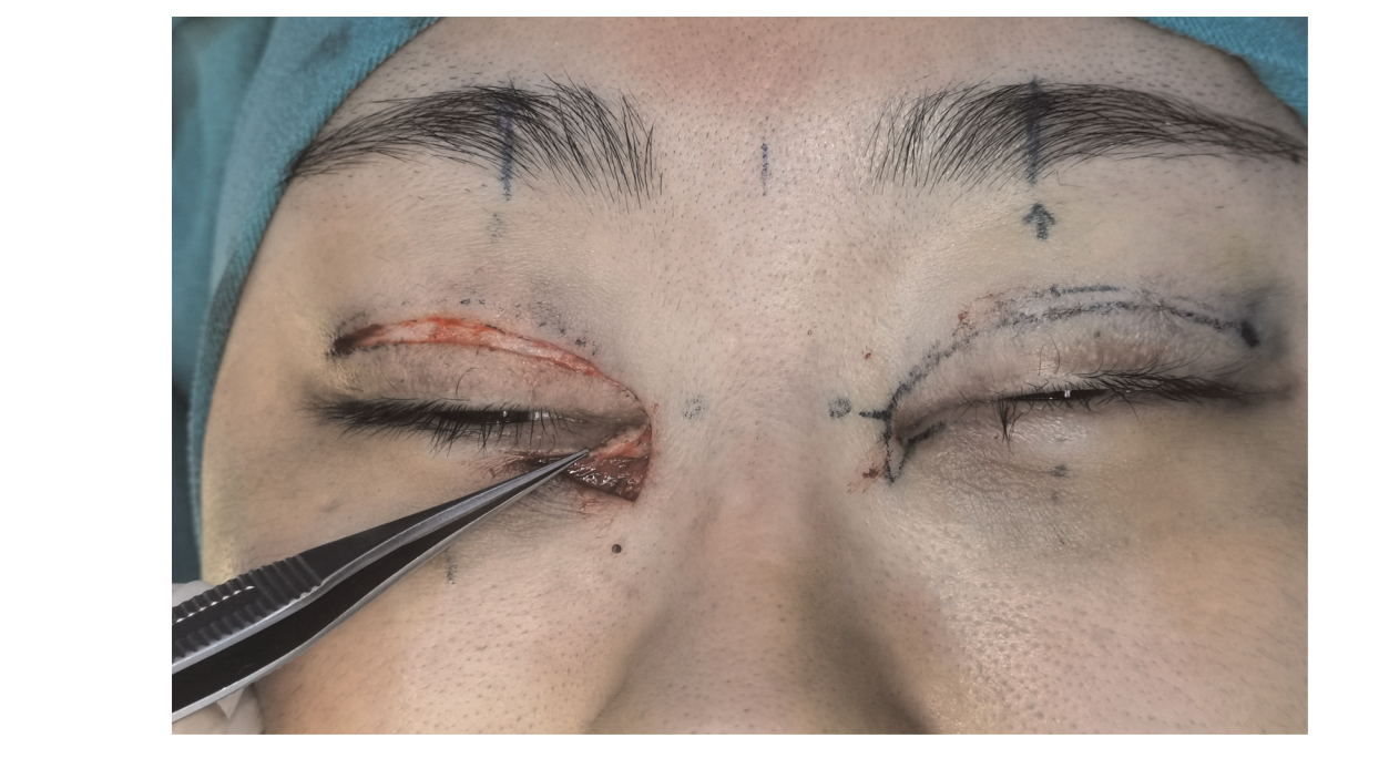
FIGURE 3 | Short-arm scar fascia flap turned 180 degrees upward as the lining of the inner canthus.