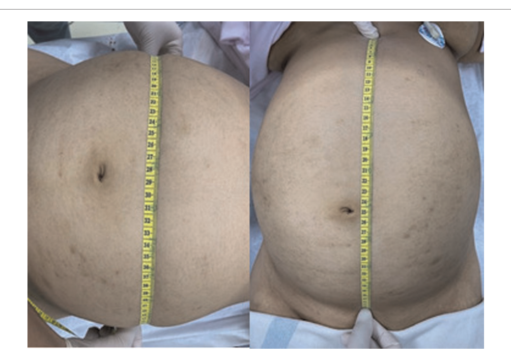
FIGURE 1 | Measurement of the abdominal mass during physical examination.

The many of mucinous tumors were benign mucinous cystadenomas (85%). These tumors can grow to a very large size. They usually occur as large multicystic masses containing mucus and fluid, usually appearing in women in their 20 to 40 s. Its large size itself can be a sign of mucinous histology (7). Our patient's presentation was pathognomic: enlarged abdominal distension filled the entire abdominal cavity, accompanied by symptoms due to compression of adjacent organs including constipation, difficulty defecating, urinary disturbances, early satiety, and edema of the lower extremities due to venous pressure and lymphatic vessels. Patients come to a secondary hospital after being referred from a primary health facility (Community Health centers). In fact, the patient has felt that his stomach is getting bigger in the past year which is getting bigger and bigger. Because he did not experience severe complaints, this patient did not go to the