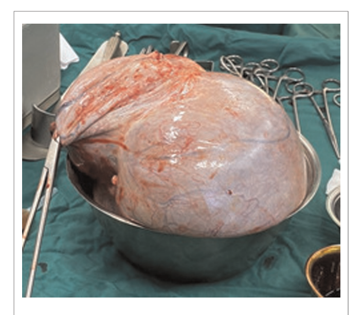
FIGURE 3 | Completely removed the giant ovarian tumor.

hospital. So far, she only goes to an independent practice doctor if there are complaints of pain or shortness of breath. Because the complaint of shortness of breath was getting worse and was not cured by taking medication, the patient came to the hospital. Social, economic, and educational factors affect patients late for treatment at the hospital.