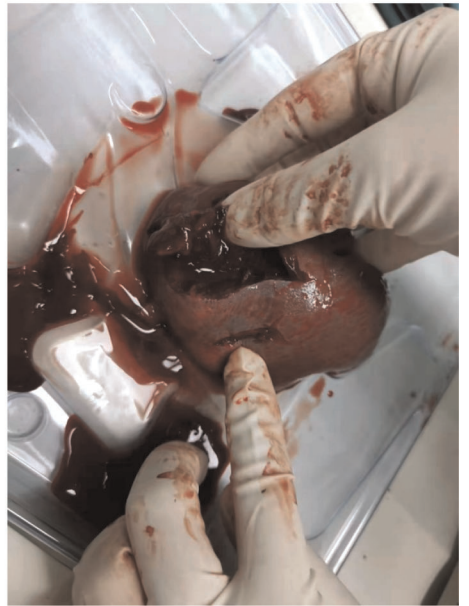
FIGURE 1 | Images of abdominal computed tomography and ruptured spleen. (A) Abdominal computed tomography showing splenic hematoma and large amount of free intraperitoneal fluid. (B) Two lacerations of the ruptured spleen.