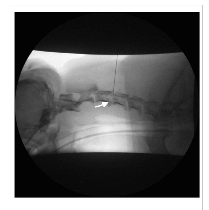
FIGURE 1 | Left lateral fluoroscopic projection of the cervical vertebral column (Case 1). A spinal needle is inserted dorsally at the level of the C3–C4 intervertebral foramen. Opacification of the C3-C4 intervertebral disk and foramen is also apparent (arrow).

Immediate improvement in lameness was apparent while in the hospital. The patient was discharged with tramadol PO (1.4 mg/ kg q8 h) and gabapentin PO (5.5 mg/kg q12 h) to be combined