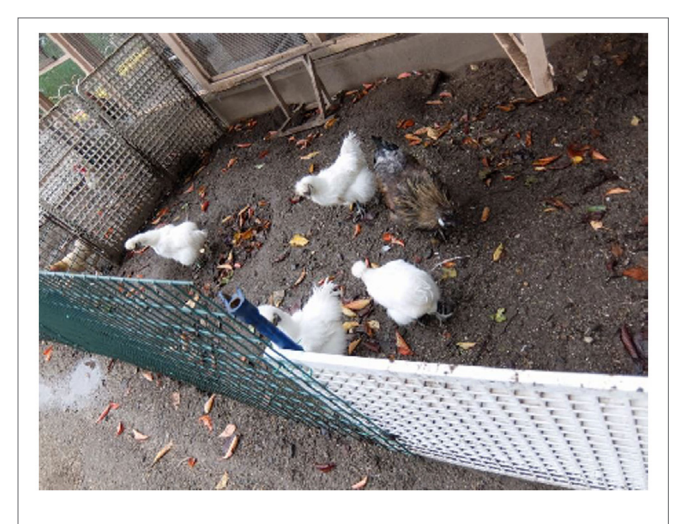
FIGURE 2 | Animals in the animal house of the schoolyard.

Among the schools that own animals, more than 70% responded they utilize school animals for teaching living