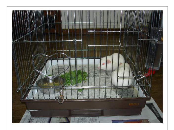
FIGURE 3 | Animals in a cage in the classroom.

environment studies. In the event of an animal's death, almost 80% of schools replied that they would bury the animal with the pupils taking part (39). Teachers think that raising animals fosters respect for life, kindness to animals, a sense of responsibility, and consideration for others in children. The background of teachers' such belief is that children take care of animals on their own. In line with the school curriculum, teachers observe the pupils' activity, and those in upper grades help the ones in lower grades develop their skills of caring for animals. The background of such animal-rearing education is the belief that taking care of animals helps children's scientific and psychological development.