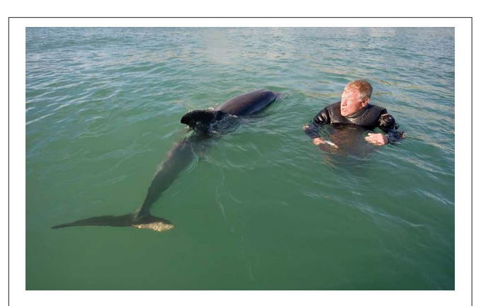
FIGURE 4 | After "Dave" received a severe wound to her tail, attempts were made to give her fish laced with antibiotics (Photo: Terry Whittaker).

Bejder et al. (34) noted that when wild animals become habituated to contact with humans it can lead to negative