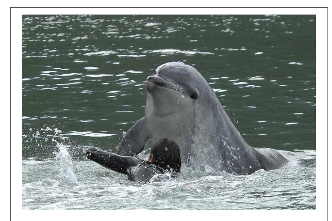
FIGURE 6 | "Moko" being pursued by a swimmer in Whakatane, New Zealand.

day,<sup>59</sup> "Dolphy," "Beaky," and "Simo" in Wales were known to have swum and played with dogs (4) and Figure 5 shows a dog approaching "Moko" in New Zealand.