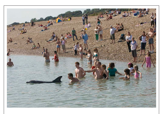
FIGURE 3 | Large numbers of people traveled to see "Dave" and to interact with her.

Solitary dolphins may seek out interactions with humans including touch, social, sexual and play behaviors (2). This contact, to some extent at least, seemingly replaces the social interaction and physical contact that would otherwise be provided by conspecifics (2) and can become very important to the individual animal. Bloom et al. (25) reported that a solitary dolphin in Northumberland, England regularly partook in interactions with swimmers and boats. The dolphin actively engaged in recreational activity with humans during 121 of 194 opportunities (62%) during the study period. Another dolphin living in British waters, "Dave" (see Figures 2, 3), was seen to spend almost a third of her time accompanied by humans or boats (26) whilst "Filippo," the dolphin who lived in Manfredonia harbor in Italy, exhibited different behaviors within different areas of his home range. Within the port he was observed