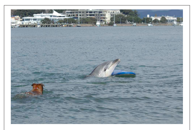
FIGURE 5 | "Moko" with a surfboard he had "stolen" and a dog swimming after him.

There are also cases of solitary dolphins interacting with domestic animals. "Dougie," in Ireland, for example, regularly interacted with a pet dog who would swim with him every