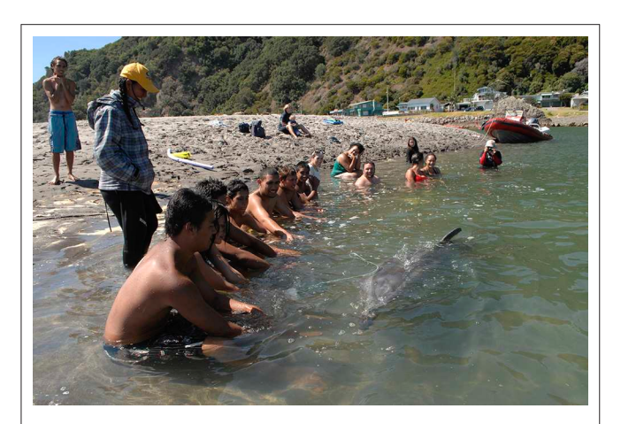
FIGURE 8 | "Moko" the solitary-sociable dolphin interacting with the public under the supervision of his guardian (wearing the yellow cap).

dolphins "Dolphy" and "Fanny" both had guardians who worked alongside local supporter groups and under the supervision of the University of Marseille (23). Some of "Moko"s interactions with people were monitored by a guardian (see Figure 8 ).