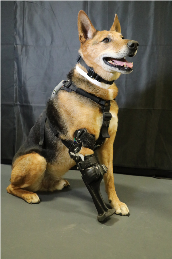
FIGURE 1 | Example of a thoracic limb prosthetic device for a patient with a mid-radius amputation.