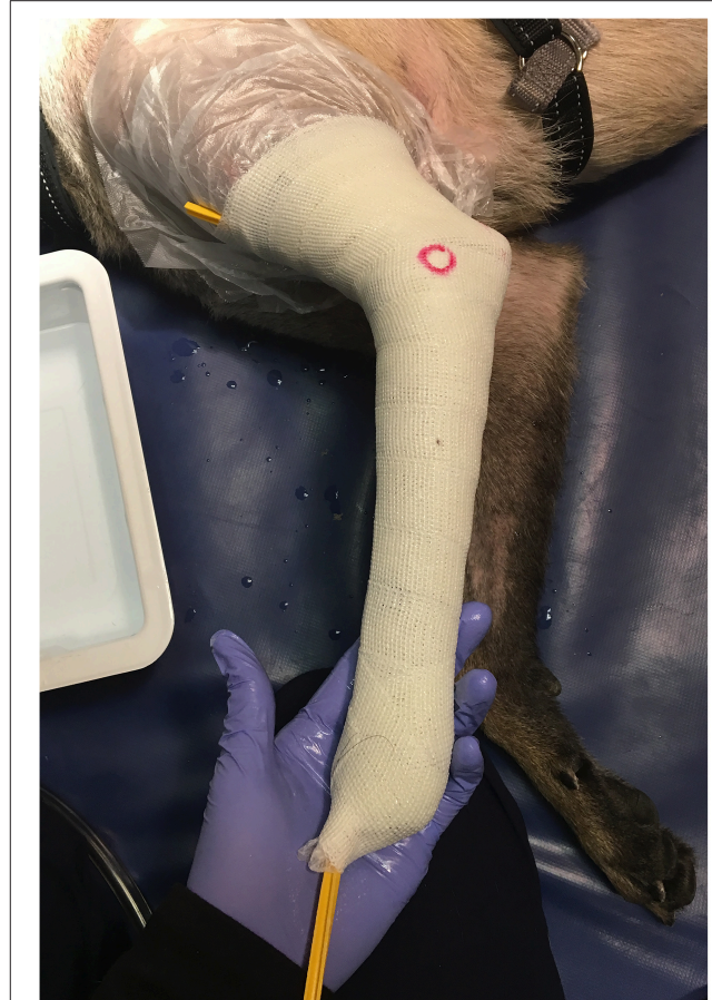
FIGURE 2 | Photograph of a limb casted for a prosthetic device creating the mold used to manufacture the prosthetic.

fiberglass cast tape by the referring veterinarian ( Figure 2 ). Initial prosthesis fitting, recommendations for prosthesis use, and aftercare associated with the device were all provided by the referring veterinarian. Complications were addressed by the veterinarian with support from the manufacturer, and any necessary revisions to the device were made by the veterinarian or by sending the device back to the manufacturer.