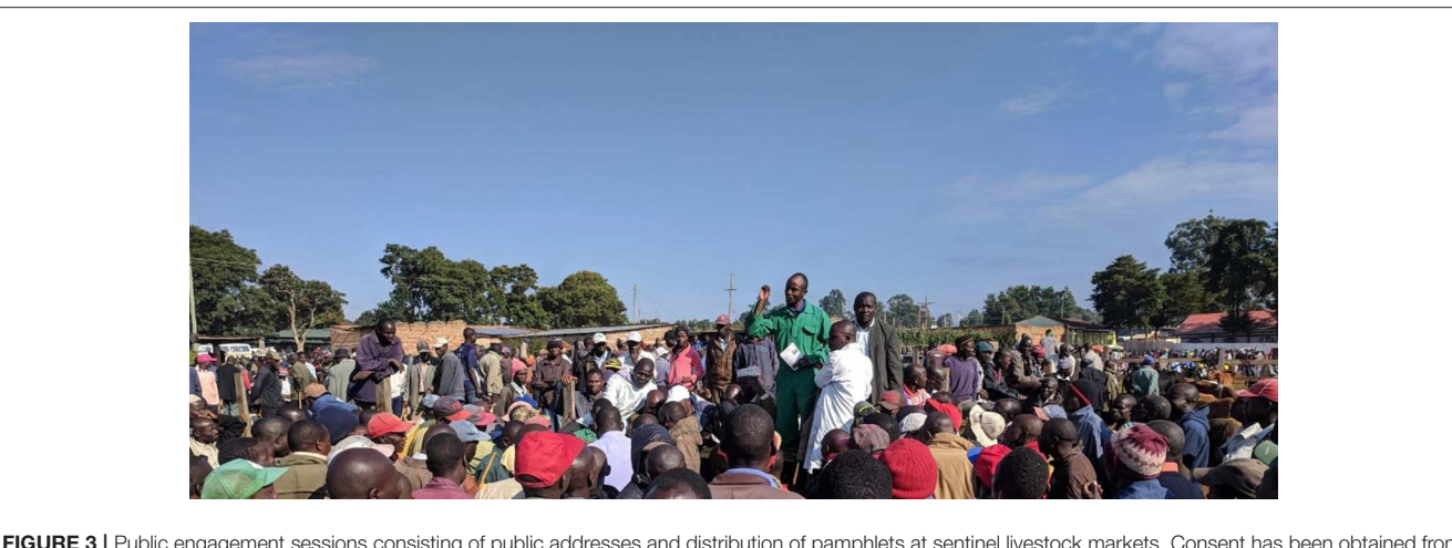
FIGURE 3 | Public engagement sessions consisting of public addresses and distribution of pamphlets at sentinel livestock markets. Consent has been obtained from all participants identifiable in the photos.