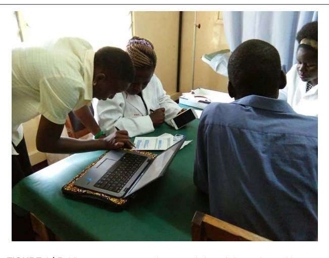
FIGURE 6 | Public engagement sessions consisting of discussions with individual stakeholders at the sentinel hospitals. Consent has been obtained from all participants identifiable in the photos.

beyond research-focussed activities to one integrated in the national surveillance system.