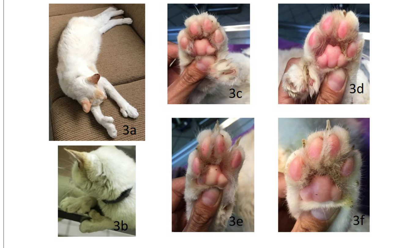
FIGURE 3 | 14-year-old neutered Mexican male cat. (a,b) Head: in an equilateral triangle. Paws: short, of medium bone, strong musculature, medium-sized feet, round, and compact. Polydactyly in the four extremities, (c,d) two accessory fingers preaxially in front and (e,f) one in the back.

a pre-cleaned microscope slide, fixed, and then stained with acridine orange supravital stain. The frequency of RBC-MNE was examined under the microscope (Carl Zeiss IVFL Axiostar Plus® equipped with fluorescence IVFL filters of 450–490 nm) at 100× optical amplification (planachromatic, 1.25 oil). RBC-MNE quantification was performed using 10,000 erythrocytes as previously reported, but the result was reported in 1,000 erythrocytes (7, 8, 16).