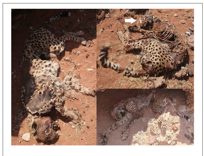
FIGURE 2 | Close up of the carcasses of the three cheetahs. These pictures were taken during the second visit, 22 days after the estimated time of death. Note the GPS collar on the neck of the upper right cheetah pointed out by a white arrow.

Analysis of the GPS data revealed two clusters of GPS locations. One was the place of death of the cheetahs and the other was located 1.9 km away from the location of the dead cheetahs ( Figure 3 ). When visiting the yet unknown cluster in the field on the 27th of October 2019, a carcass of an adult mountain zebra was found ( Figure 4 ). The cheetahs were at the zebra carcass from 08:00 on the 23rd of September 2019 to 03:30 on the 24th of September 2019, i.e., 19.5 h. The GPS collar recorded