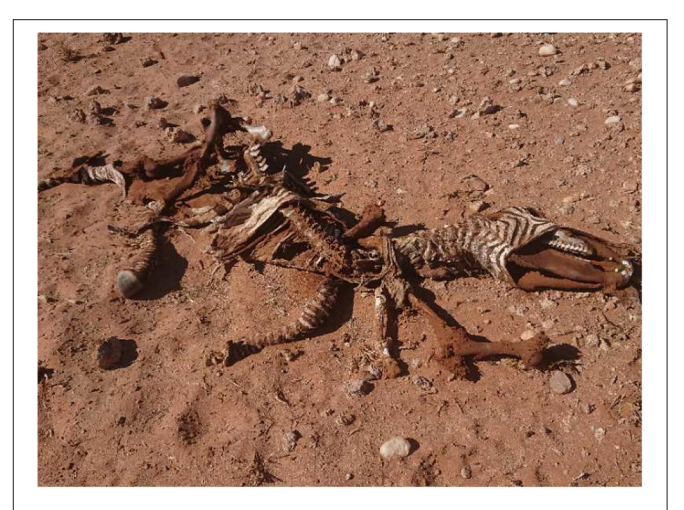
FIGURE 4 | Carcass of the anthrax positive mountain zebra which the cheetahs fed on <24 h prior to their death. The picture was taken during the first field inspection, 11 days after the estimated cheetah death.

Previous observations have shown that bacterial cultures from highly susceptible animals that die quickly, such as cheetahs, are often anthrax negative by bacterial culturing as they die at