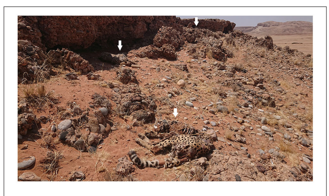
FIGURE 1 | Two of the three cheetah male carcasses (left and middle arrow) as found 11 days after they died. The carcass of the third animal was found approximately 10 meters away behind a rock (right arrow).