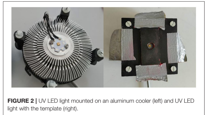
FIGURE 2 | UV LED light mounted on an aluminum cooler (left) and UV LED light with the template (right).

The irradiance of the UV LED light weighted with the CIE action spectrum was therefore 1.48 \text{ mW/cm}^2 .