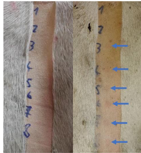
FIGURE 4 | Photograph of the shaved area immediately after irradiation (left) and 24 h after irradiation (right). The perceptible erythema is marked with arrows. The third dose was the lowest dose that still produced perceptible erythema. The minimal erythema dose (MED) on shaved skin for this cow was therefore 300 J/m 2 .

The irradiation produced visible erythema, which resolved spontaneously in 1 week. The animals showed no discomfort during or after the irradiation. The results of UV irradiation are shown in Table 2. The average MED-H was 5595 J/m 2 , while the average MED-S was 329 J/m 2 . Heifers had a higher MED-H