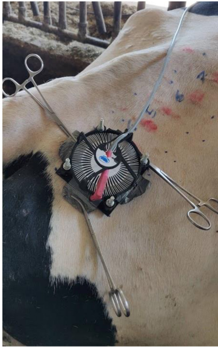
FIGURE 3 | UV light-emitting diode (LED) fixed onto the dorsal pelvis region of cattle with Rochester-Pean forceps.

irradiation were evaluated after 24 h, always by the same two researchers (Figure 4). The lowest dose that produced perceptible erythema was chosen for the MED. The difference between the MED-H and the MED-S was used to calculate the UV transmission through the bovine hair coat.