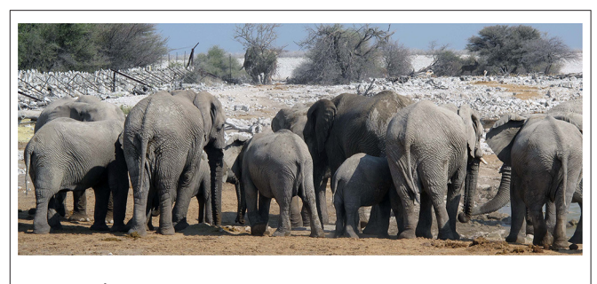
FIGURE 4 | African elephants at waterhole in Etosha National Park, Namibia.

Thompson suggests that through aesthetics, an organism can "involve itself in the mathematical regularities of the universe ", citing seasonal changes, cycles of day and night, soundwaves and rhythmical movement as some facets of life on earth that can be represented numerically with accuracy (3). Brando and Buchanan-Smith advocate for animal welfare that takes the patterns of natural life cycles into account (79), while Coe and Hoy (80) argue that abandoning schedules can offer captive animals a kind of relative freedom, allowing for control and self-sufficiency within a population. Captive environments need to be carefully managed, but for a wild animal, there is no such thing as a regular feeding time, for example, although natural activities, such as hunting and foraging, have their own rhythms and chronologies. A tightly managed lifestyle can lead to over-reliance and boredom, potentially contributing to stereotypical behavior.