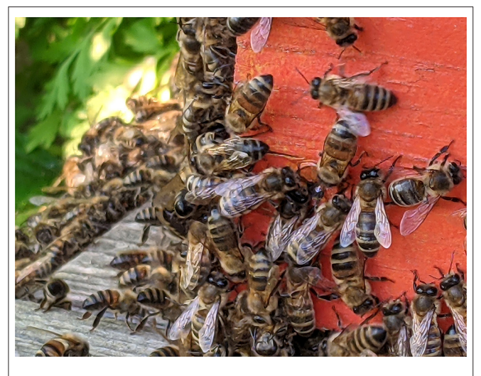
FIGURE 7 | Honeybees in Kent, UK.