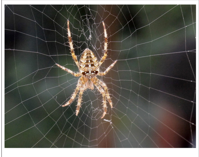
FIGURE 1 | Orb-weaver spider in London garden, UK.

Experiments have demonstrated that sensory preferences occur outside sexual selection (20), and that reactions to specific stimuli can be learned, which means they are based in cognitive processes, not only occurring as naturally selected behaviors. Moreover, preferences depend on context – they are flexible and can be influenced by both internal (e.g., hormonal) and external