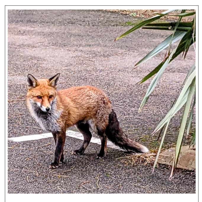
FIGURE 10 | Urban fox in Battersea, UK.