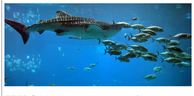
FIGURE 3 | Whaleshark and shoal of golden trevally in Georgia Aquarium, USA.

fish generate complex water movement that may confuse their predators (50).