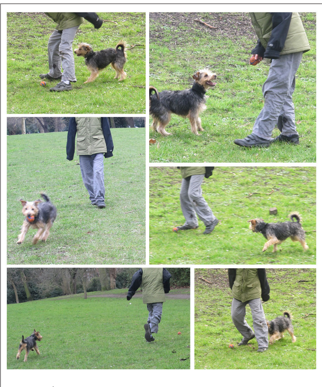
FIGURE 8 | Terrier playing ball with human, London, UK.

might entail stalking, coursing, ambushing or scavenging; killing through disabling and dispatching; eating and subsequently processing (127).