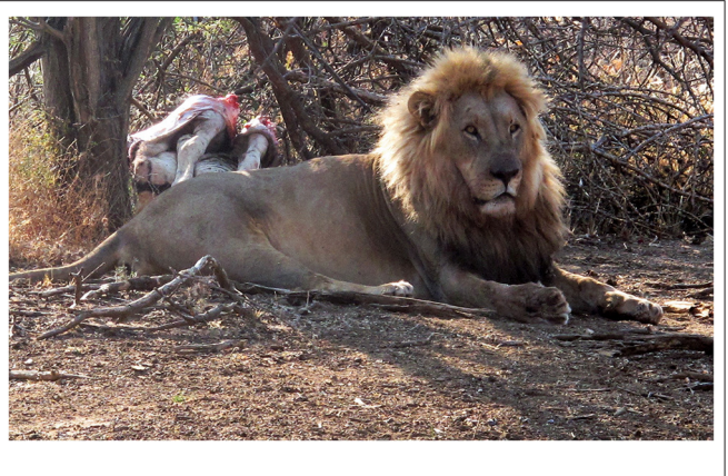
FIGURE 9 | Lion with zebra carcass, Waterberg Plateau Park, Namibia.