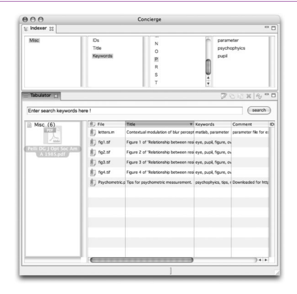
Figure 1. A screenshot of the Concierge minimum configuration. Tabulator plug-in (lower window) provides basic functions such as registration and keyword search of resources. Indexer plug-in (upper window) offers an index search function.

data on the dialog. In addition, users can create a new category from the right-button menu of the Tabulator. The created category has the same metadata format as the "Misc" except for the category name.