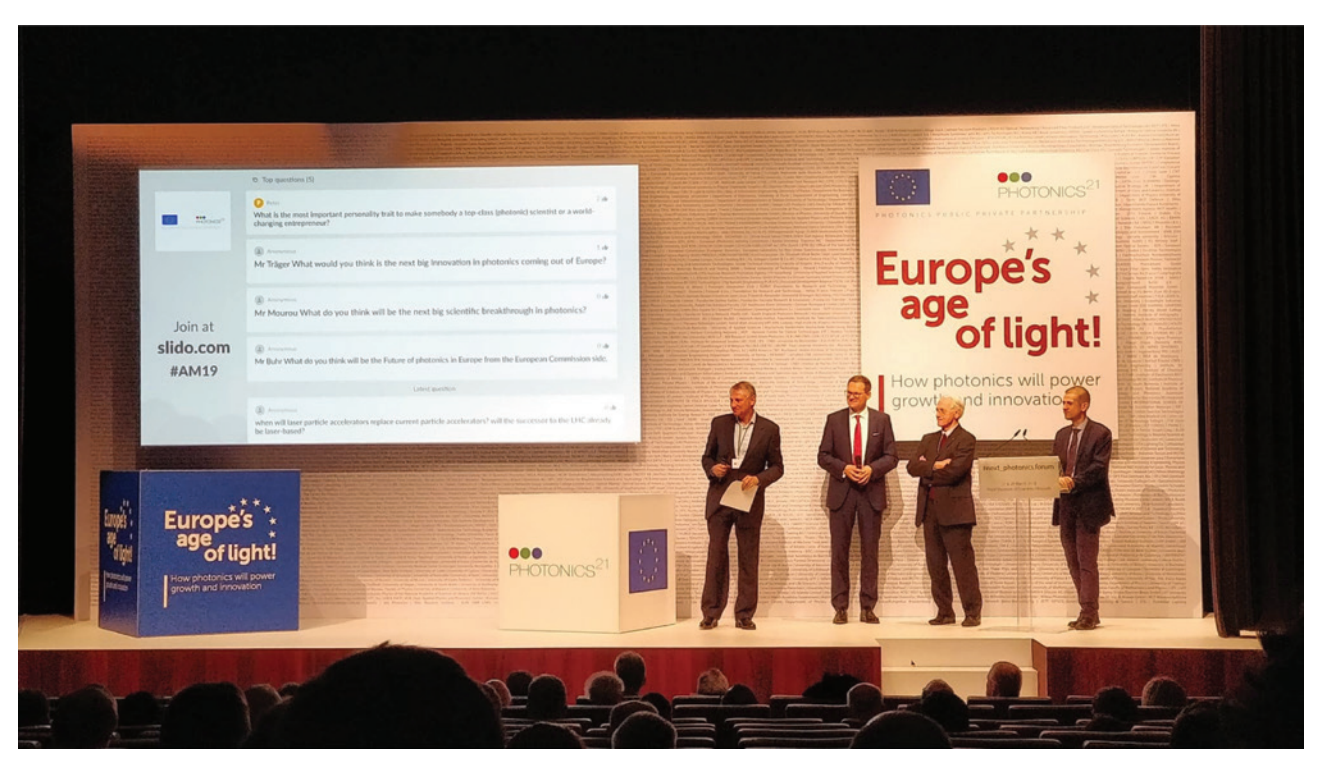
Photonics21 released the roadmap to Photonics funding at their annual meeting in Brussels at the end of March.

The issue of photonics being diluted in Europe was one of the discussion points, and a united message and communication will be created, joining forces world-wide to