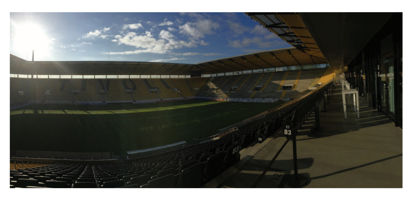
Attendants of the workshop enjoyed a very special location so far: The lounge of the local soccer team. But the event has grown beyond that lounge and so, the next UKP-Workshop on April 21 and 22, 2021, will probably see another and larger place.

One example was shown by Stephan Brüning (Schepers GmbH). He used a 500 W ultrafast laser source for processing of printing rollers. A few years ago, he started with four separate lasers to improve efficiency, but now with the new system he divides the strong laser beam into 16 beamlets which are each controlled by an acousto-optic modulator.