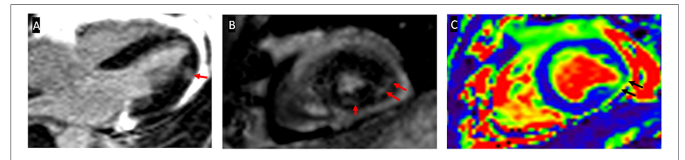
FIGURE 2 | Cardiac magnetic resonance imaging (C-MRI) imaging illustration of patient 1. (A) 4 cavity sections with a late enhancement of gadolinium and (B) transversal section showing infero-latero-medial mesomyocardic contrast (red arrows). (C) T2 mapping showing focal infero-latero-medial myocardial edema (black arrows).

ECG, electrocardiogram; ICI, Immune checkpoint inhibitors; TTE, Transthoracic echocardiogram; LVEG, Left ventricular ejection fraction; Cardiac-MRI, Cardiac Magnetic Resonance Imaging.