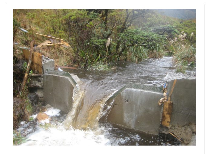
FIGURE 2 | V-notch weir for river flow measurements installed as part of the iMHEA monitoring network in the Peruvian Andes.

As a result of these drivers, the highlands of Piura have pioneered in citizen science-based hydrological monitoring led by a regional NGO (Consortium for Sustainable Development of the Andean Ecoregion, CONDESAN). The initiative for Hydrological Monitoring of Andean Ecosystems (iMHEA in Spanish, CONDESAN, 2014), was established in 2009 (Célleri et al., 2010). The network focuses on pairwise catchment monitoring to identify the hydrological impacts of land-use change, and the benefits of restoration activities. At present, it consists of 20 catchments in the tropical Andes (Venezuela to Bolivia), including 5 catchments in the Piura highlands (Figure 2). Monitored variables are rainfall and streamflow, in some sites complemented with meteorological variables to