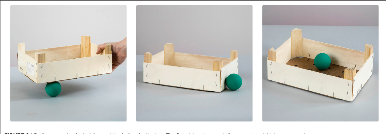
FIGURE 2 | Coding examples for test item put the ball under the box. The first picture is correct, the second and third are incorrect.

was used to create and run the test sessions (Peirce, 2009) meaning that children in Germany and Poland both heard the same instructions.