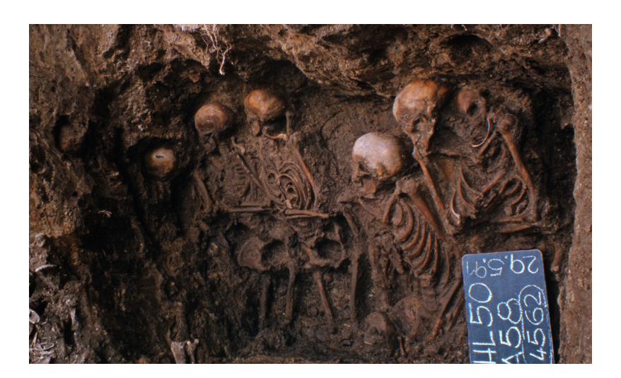
FIGURE 1 | Heiligen-Geist-Hospital ("Holy-Ghost-Hospital") archaeological context 4562 in which S. Paratyphi C-positive individuals were found.

As DRB1*04:05 is protective against enteric fever, its frequency would be expected to be lower relative to the modern controls (0.45%, Germany, AFND Population 8, n = 39,689; 33). Thus, DRB1*04:05 was not investigated due to the case sample being too small for a meaningful statistical analysis based on the power calculation. On the contrary, for the DRB1*03:01 risk allele, an association study was feasible making it the main focus of this investigation. Out of the 11 individuals with a DRB1*03 allele call at 1<sup>st</sup>-field resolution, calls at 2<sup>nd</sup>-field resolution were possible for four individuals who consistently showed DRB1*03:01. Among the known alleles of the DRB1*03 allele group, DRB1*03:01 is by far the most common in the modern German population (freq = 10.2%), with the next frequent allele being two orders of magnitude less frequent (DRB1*03:02, freq = 0.1%). It is therefore highly likely that the other seven individuals with a DRB1*03 call also carried the DRB1*03:01 allele, justifying an association analysis based on the DRB1*03 calls. Moreover, four individuals were possibly homozygous for the DRB1*03 type, given the available read depth and lack of other DRB1 sequences. However, a conservative approach was used here and these individuals were regarded as