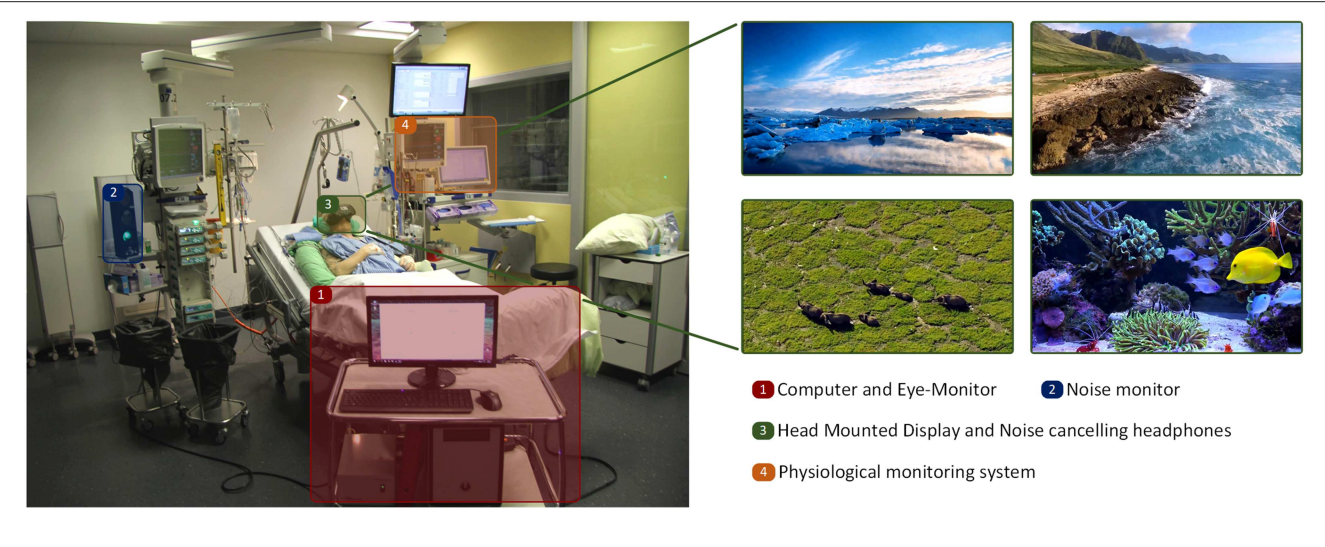
FIGURE 2 Patient during the stimulation in the ICU session, including setup and stimulation examples.

Agitation-Sedation Score (RASS) (33) of 0. In the second VR treatment during the ICU stay, patients had, on average, an APACHE II score of 22.3 (95% CI 20.3–24.2) and a SAPS II of 53.4 (95% CI 48.1–58.6), and all were extubated [on average within 8.1 h (95% CI 6.4–9.8)]. ICU length of stay was 0.9 days (95% CI 0.8–0.9). In the pre-ICU and follow-up sessions, 54.6 and 66.7%, respectively, of the patients received medication influencing blood pressure, while 33.3 and 69.7%, respectively, received medication influencing heart rate. During the ICU session all patients received medication influencing the heart rate, blood pressure and respiratory rate (i.e., antihypertensives or catecholamines, analgesics, sedatives). Patients who did not participate in all sessions were not considered in the final analysis and were considered as drop-outs. All dropouts were unrelated to the VR stimulation.