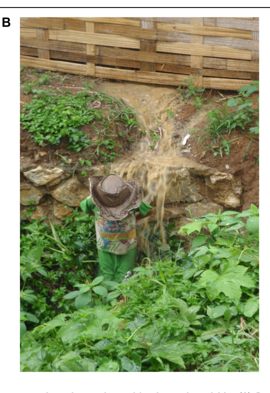
FIGURE 1 | In developing countries the lack of adequate infrastructures means that contaminated water is used for domestic activities (A). During the rainy season when river and stream flow is high and temperatures are elevated children often play in water contaminated with latrine overflows (B).