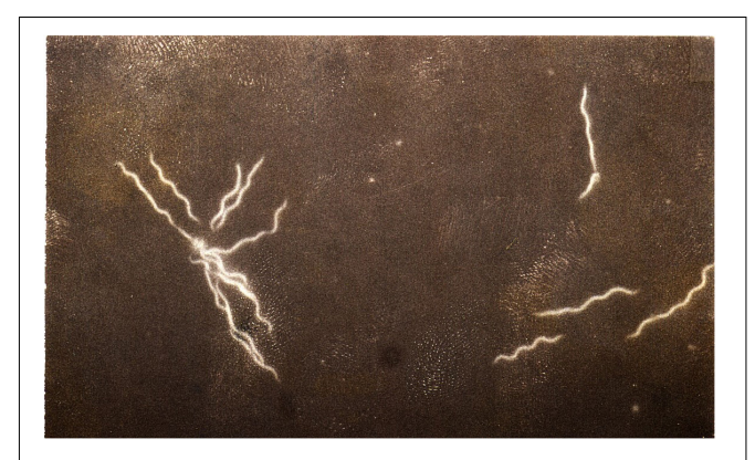
FIGURE 2 | Photomicrograph of a wet mount preparation of a small growing colony (left side) and separate organisms of B. burgdorferi after several days of culture in BSK medium (Wormser et al., 2001); dark-field microscopy, 400X magnification.

FIGURE 1 Photomicrograph of Giemsa-stained B. burgdorferi , sensu stricto, after culture in BSK medium as previously described (Pavia and Plummer, 2013). Magnification, 400X; bar = 50 \mu .