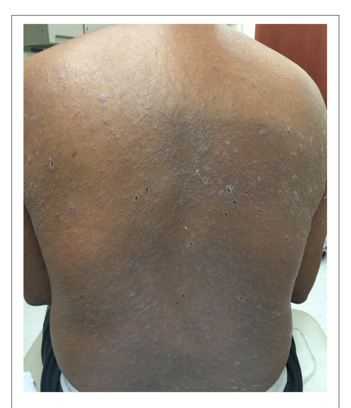
FIGURE 1 | Clinical image of the cutaneous eruption that developed after six cycles of nivolumab. On the back, there were widespread and numerous 3–10 mm pink to pink-brown thin flat-topped papules and plaques with scale.