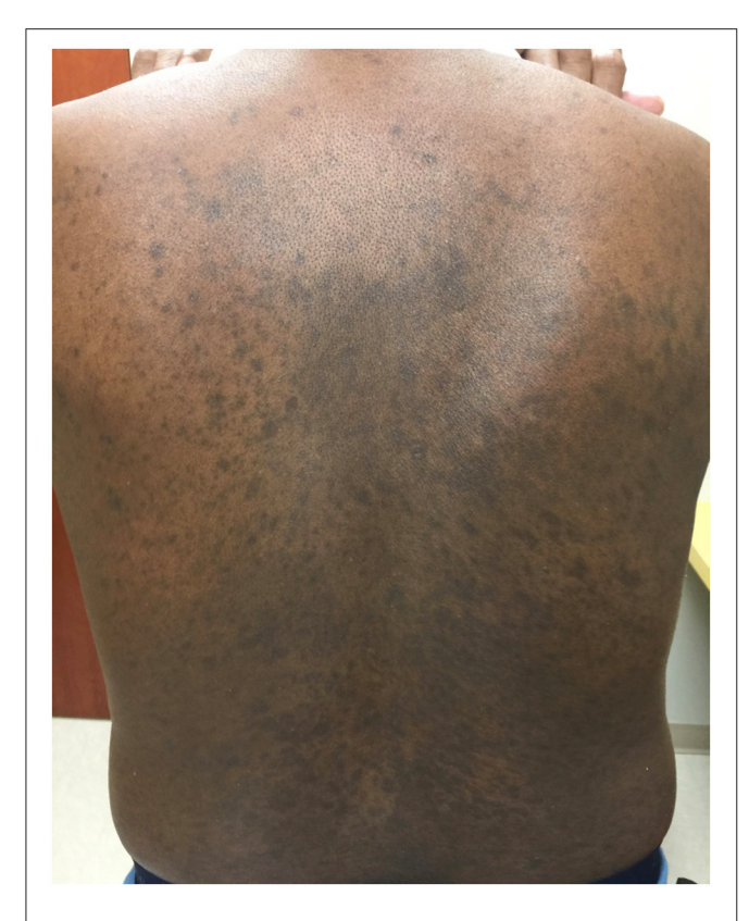
FIGURE 3 | Clinical image after successful treatment with NBUVB. On the back, there were widespread and numerous hyperpigmented macules coalescing into patches. There was no erythema or scale.