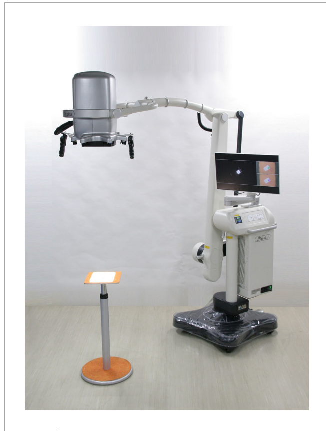
FIGURE 1 | The Medical Imaging Projection System (MIPS). Photograph of the commercial-type MIPS used in this study.