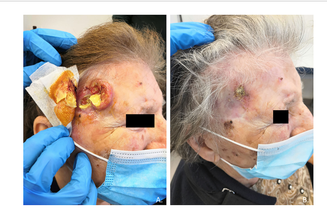
FIGURE 2 | Case report of a rapid clinical response, after only one course of therapy with cemiplimab, in an 83-year-old patient with locally advanced recurrence of cutaneous squamous carcinoma of the right temporal region (A,B).

the introduction of immunotherapy in clinical practice, a standard of care for advanced CSCC was not clearly defined, and up to 60% of patients with advanced CSCC did not receive any systemic therapy at all, due to the low clinical activity and high risk of severe toxicities (21). Based on a strong preclinical rationale, clinical trials were conducted leading to the registration by the regulatory authorities of anti-PD-1 immunotherapy in patients with advanced CSCC (21). Cemiplimab was the first PD-1 inhibitor receiving an indication in CSCC after showing in a clinical trial rapid and durable responses in more than 40% of patients (in Figures 1 , 2 we reported two clinical cases of rapid clinical response), with a favorable safety profile. In addition to that, cemiplimab led to an improvement in health-related quality of life with a reduction in cancer-related pain after a few cycles of therapy (18, 43, 44).