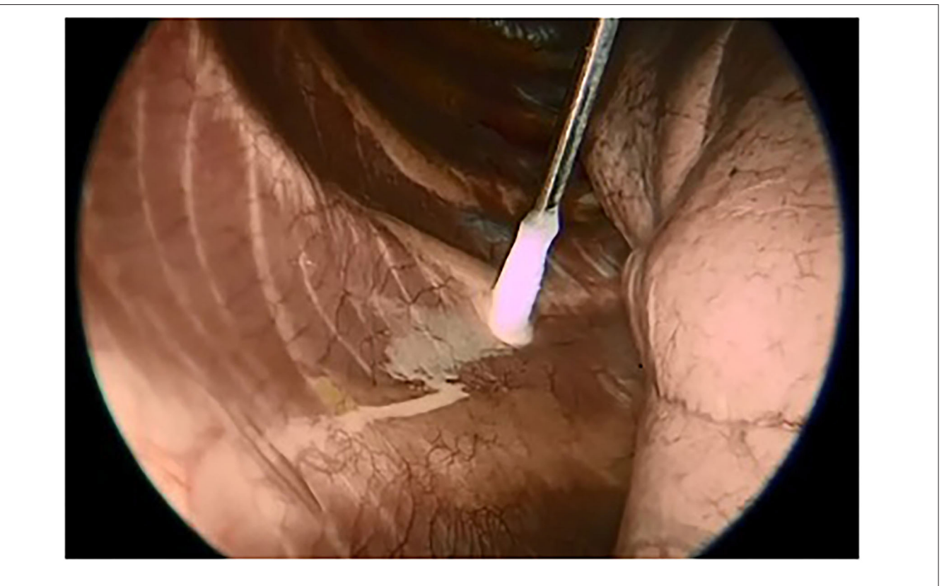
FIGURE 2 | Thoracoscopic view of the ice ball.