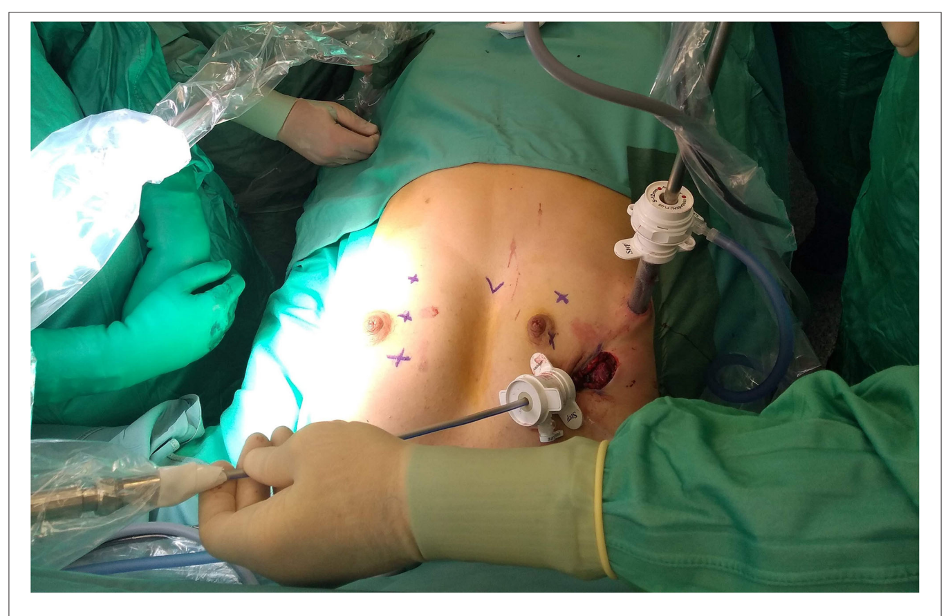
FIGURE 3 | Probe insertion through a 5 mm. Trocar placed at the site of surgical incision.

In all patients cryoanalgesia was successfully performed before standard MIRPE. After the first 4 patients, it was decided with the manufacturer to additionally improve the cryo-performance, based on challenging situation generated by the core heat counteracting the generation of the freezing effect. The cryoprobe microchip was calibrated to obtain a gas flow able to adequately perform. The dedicated cryoprobe was designed to generate a 3 cm long ice ball providing the desired freezing effect at the very end of the probe only. The equipment allowed performing the procedure in both automatic or manual mode. Surgical approach was also slightly modified. In the first 4 patients, the probe was inserted into the thorax through a 5 mm port, placed at the level of skin incision ( Figure 3 ). In the last three patients, it was preferred to insert the probe through a further more medial percutaneous trocarless access, in order to have a better access