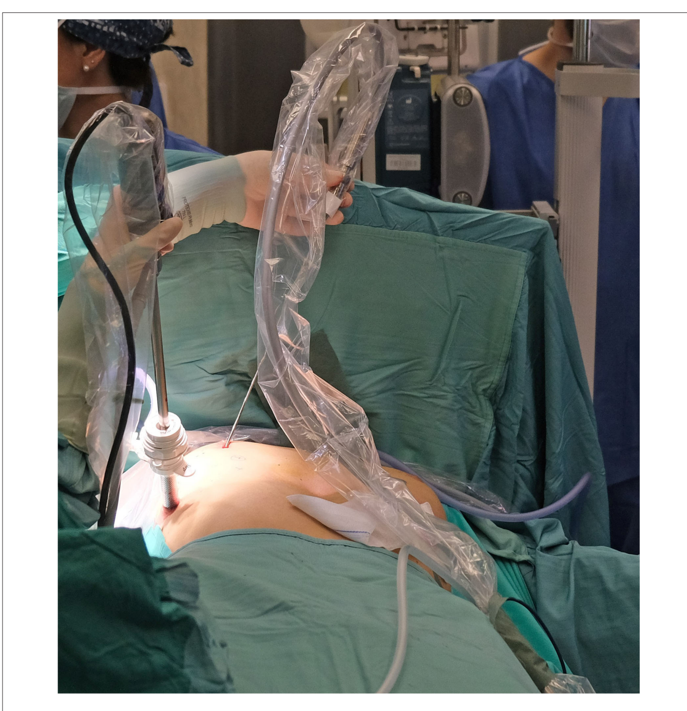
FIGURE 4 | Trocarless percutaneous probe insertion in a medial position.

to the posterior aspect of the ribs and the intercostal nerves (Figure 4).