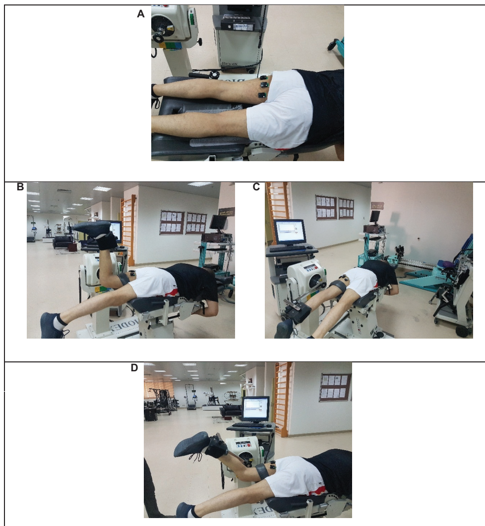
FIGURE 1 | Testing procedures showing the zero-offset of myoelectric activity prior to testing (A), the range of motion from 90° knee flexion (B) to full knee extension (C) during maximal unilateral eccentric knee flexor actions, and (D) knee flexion angle at 60° during the isometric fatigue protocol.

device were calibrated according to their respective manufacturer's instructions. Additionally, a zero-offset of EMG activity was established during a 10-s time interval while in a relaxed prone position state prior to testing. In order to determine EMD, the time delay between onset of myoelectric activity and torque generation during maximal eccentric knee flexor actions was calculated (Lacourpaille et al., 2013). More specifically, EMD was defined as the time interval (in ms) between the onset of myoelectric activity of the semitendinosus, semimembranosus, and biceps femoris muscles (i.e., increase of 15- \mu V deviation from the baseline), respectively, and the corresponding torque development (i.e., 9.6-Nm deviation above the baseline level) during maximal eccentric knee flexor actions (Zhou et al., 1995a).