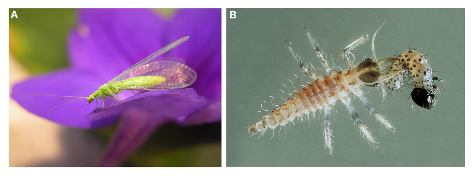
FIGURE 1 | Adult (A) and Larva (B) of the green lacewing Chrysoperla carnea.

Green lacewings in the genus Chrysoperla (Neuroptera: Chrysopidae) are widespread in agricultural areas worldwide ( Figures 1A,B ). The species are valued because the larvae are predators of small soft-bodied arthropods and thus contribute to the biological control of crop pests. The adults feed predominately on pollen, nectar, and homopteran honeydew. The most common species found throughout Europe is Chrysoperla carnea (Duelli, 2001; Meissle et al., 2012; Romeis et al., 2014). For the purpose of this paper, the name C. carnea is used for the carnea species group that includes a complex of cryptic, sibling species that are reproductively isolated by their mating songs (Duelli, 2001; Henry et al., 2001).