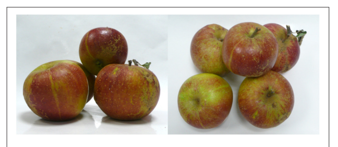
FIGURE 1 | The "Cox Orange Pippin skin phenotype." On the left: side view, on the right: top view. The majority of the fruit surface was covered by a waxy skin with small lenticels (russeting spots). Russeting was systematically found on the calyx and stalk ends of the fruit and russeted patches occurred aleatory on the fruit surface.