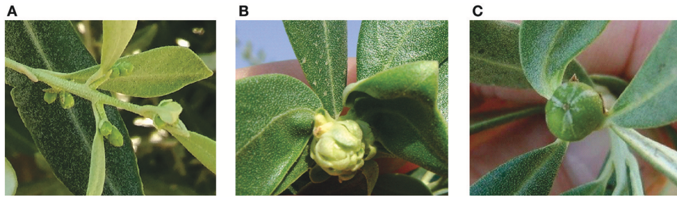
FIGURE 2 | Deformed floral buds and fruit from olive trees exposed to insufficient chilling temperatures and high temperature events. Photograph (A) is from the olive collection at INTA-San Juan (31°S, Argentina); photographs (B,C) are from semi-tropical regions of Brazil, 22°–23°S (courtesy of Dr. Shimon Lavee).

15 days in non-irrigated plots, and both pre-dawn and midday leaf water potential showed mild reductions during most of the experiment. However, this change in leaf water status was not enough to significantly decrease net photosynthetic rate, and fruit yield at harvest the following growing season only showed a modest percentage reduction (–20%). Estimates from this study suggested that little irrigation would be needed to satisfy crop water demand during the winter. Later sap flow measurements in whole trees combined with soil micro-lysimeter data during the winter also confirmed that ETc was only about 40% of reference transpiration ( sensu Allen et al., 1998). Although maximum daily temperature was often around 20°C, transpiration per unit leaf area was minimal when daily average temperature was below 13°C (Rousseaux et al., 2009), a condition frequently observed during July–August due to low night temperatures.