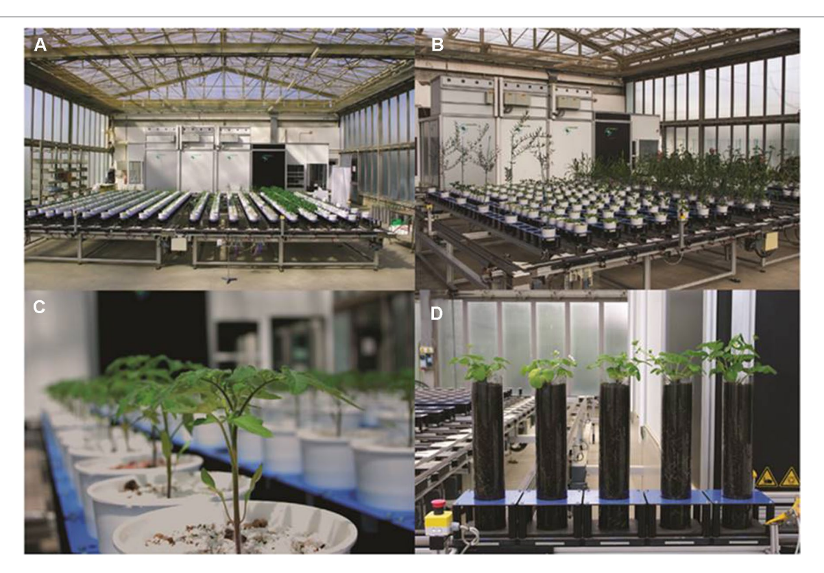
FIGURE 3 | The ALSIA greenhouse phenotyping facility (Basilicata, southern Italy) consisting of Scanalyzer 3D-systems which include conveyor belts (0.3 km and 500 cars) and image chambers: (A, B) the robot system for randomization of pots, consistent monitoring of pot weight, accurate application of water and imaging of plants; (C) phenotyping of tomato seedlings; and (D) phenotyping of root architecture.