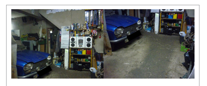
FIGURE 3 | Patient's house after medical treatment. Consent for publication was obtained.

clinical case and his photographs. His anonymity has been preserved.