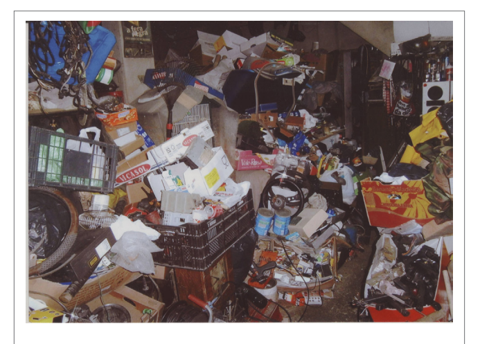
FIGURE 1 | Patient's house at beginning of medical intervention. Consent for publication was obtained.

On admission, in the mental status examination, it was observed that the patient was vigil, calm, and oriented; his mood