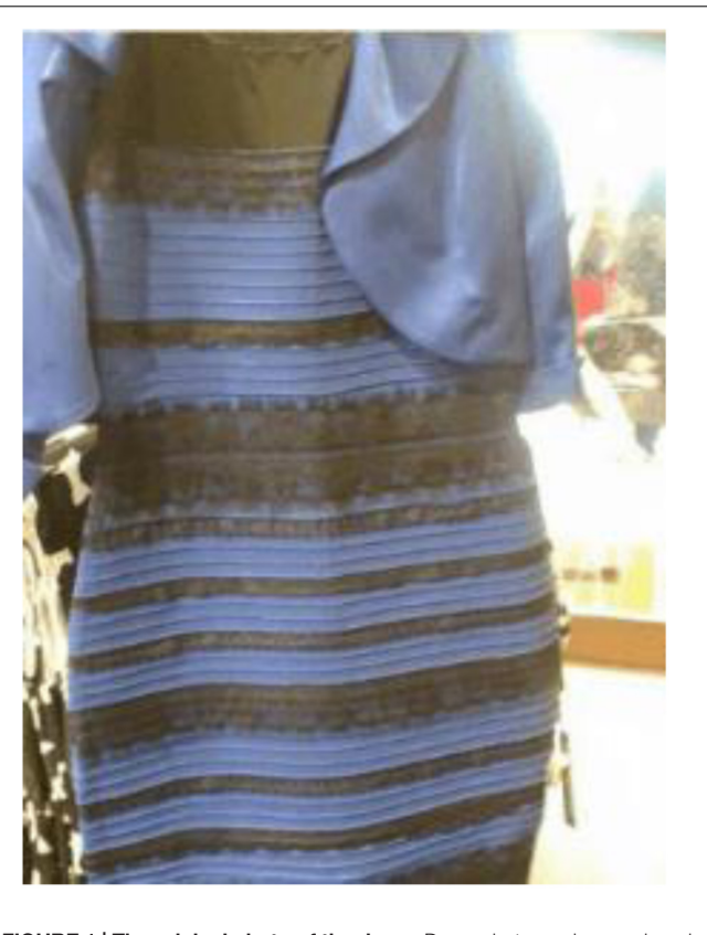
FIGURE 1 | The original photo of the dress.

Another reason could be previous experience. Lafer-Sousa et al. (2015) argued that it could be because a person may be more used to certain light conditions (for example by being a morningperson or an evening person). Furthermore, Lafer-Sousa et al. (2015) found that participants with experience of the photograph used the terms "blue and black" and "white and gold" more, as