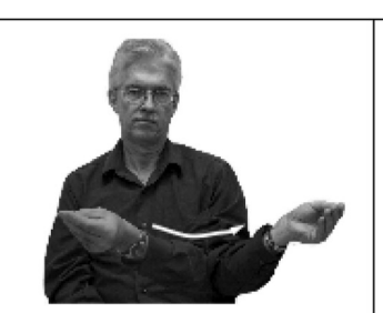
GIVE-mult 'give to several'