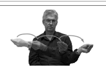
GIVE-exh 'give to each of several'