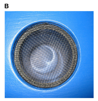
FIGURE 2 | Apparatus used in the present study. The photo depicts (A) the three cardboard boxes and the wooden platform and (B) a detail of one of three holes and plastic netting.

uncovered and participants had answered the memory-check and how long ago questions, E asked participants "What happened to the popsicle?" All participants stated that the popsicle had melted, thus confirming that they understood the melting process.